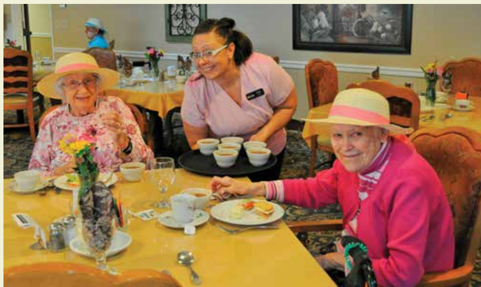
Silver recipient Summer Hill Assisted Living, Wash.

Adventist Care Center Courtland Bayside Health and Rehab Chautauqua Rehabilitation and Nursing Center Citrus Hills Health & Rehabilitation Center Commons at Orlando Lutheran Towers East Orlando Health & Rehab Center