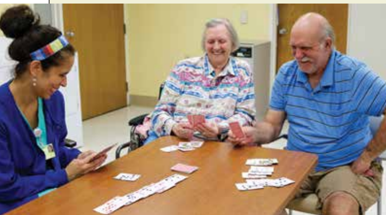
Silver recipient Opus Island Lake Center, Fla.