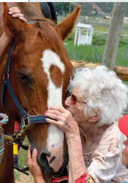
Silver recipient E. Dene Moore Care Center, Colo.

All Saints Senior Living Arbor Oaks Senior Living Colonial Manor Nursing Home Edgebrook Estates Assisted Living Good Samaritan Society – Albert Lea – Bancroft Creek Estates Good Samaritan Society – Ambassador Good Samaritan Society – Battle Lake Good Samaritan Society – International Falls Good Samaritan Society – Maplewood Good Samaritan Society – Mountain Lake Good Samaritan Society – Pine River Heritage Place of Roseville Heritage Pointe Senior Living Maple Lawn Senior Care Old Main Village Pierz Villa Poplar Creek Estates Sterling Pointe Senior Living Sugar Loaf Senior Living Sunrise of Edina Sunrise of Golden Valley