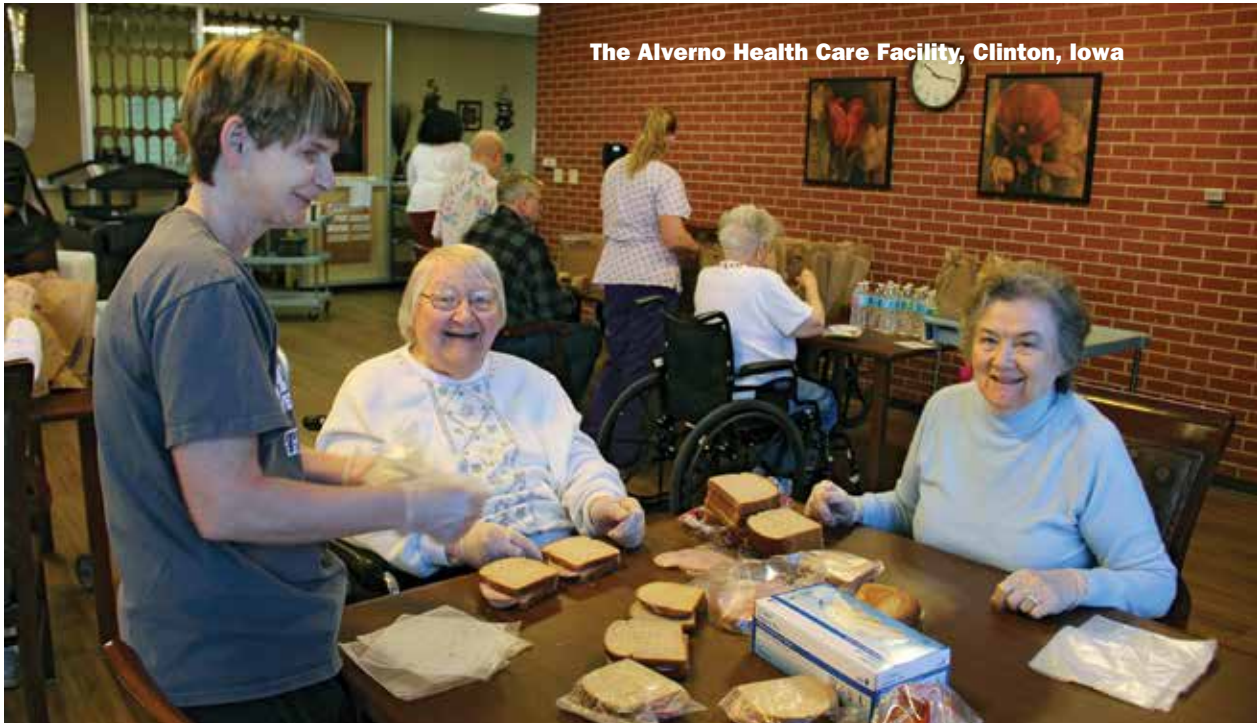
The Alverno Health Care Facility, Clinton, Iowa