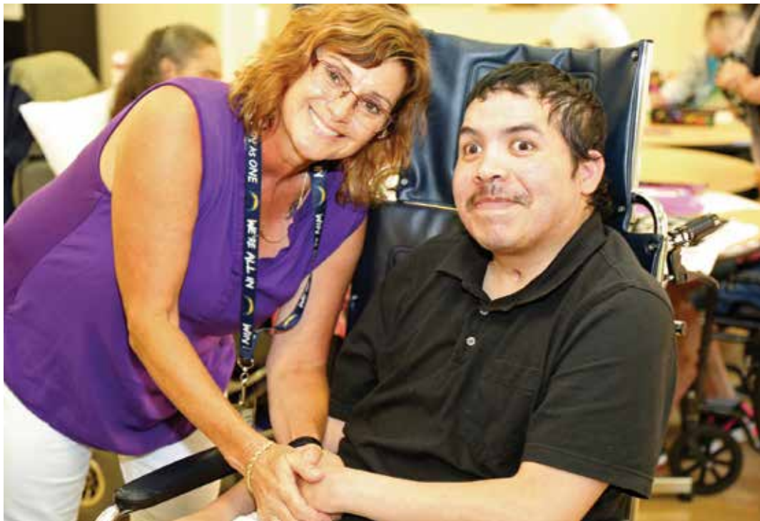
Edgemoor DPSNF, Santee, Calif.

..... Quality Award applications for 2018 for all levels will be accepted online beginning Dec. 7, 2017. For more information on the Quality Award program, visit www.ahcancal.org/qualityaward or email qualityaward@ahca.org .