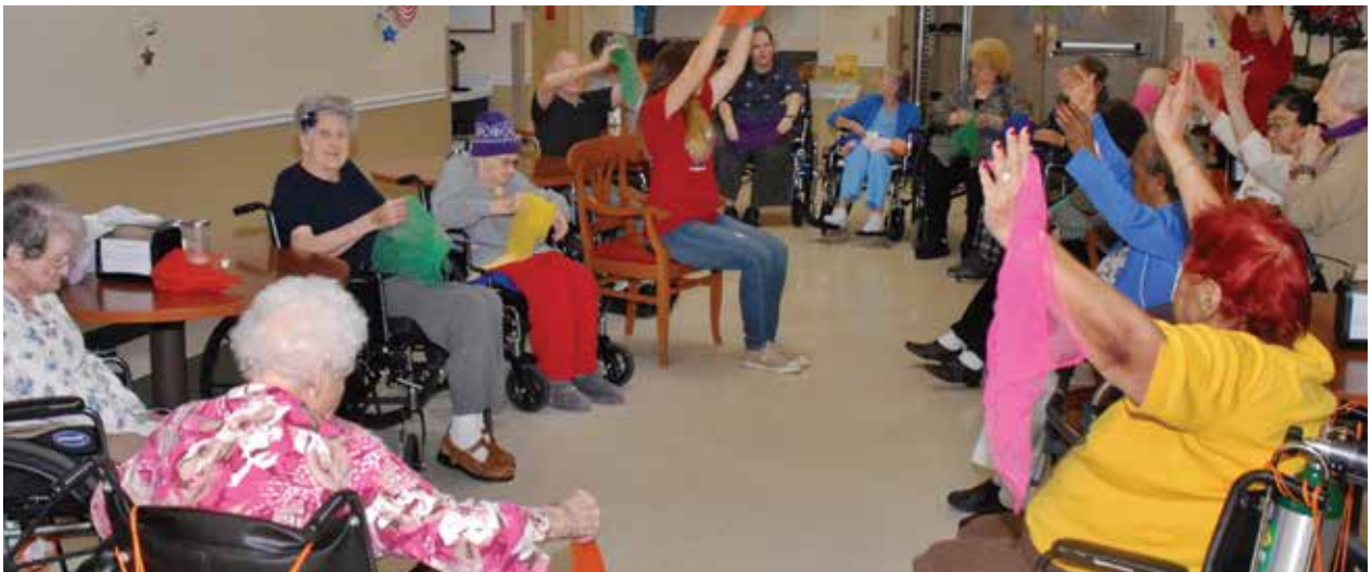
Silver recipient Life Care Center of Wayneville, Mo.

The American Health Care Association/National Center for Assisted Living is proud to announce the companies that have earned AHCA/NCAL National Quality Awards in the Silver—Achievement in Quality and Bronze—Commitment to Quality categories. At press time, recipients of the Gold—Excellence in Quality Award had not yet been announced. Gold award recipients will be honored in Provider's November issue.