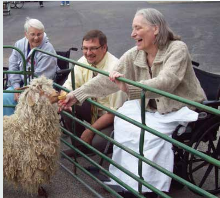
Silver awardee Hickory Ridge of Temperance, Mich.

Alexander Sandy Ninger State Veteran's Nursing Home Brighton Gardens of Boca Raton Brooks Bartram Crossing Brooks Bartram Lakes Broward Nursing & Rehabilitation Center Clifford Chester Sims State Veterans Nursing Home Community Convalescent Center Consulate Health Care of Port Charlotte Diamond Ridge Health and Rehab. Center Douglas T. Jacobson State Veterans' Nursing Home Emory L. Bennett Veterans Nursing Home Evans Health Care Center Fort Lauderdale Health & Rehab Glades West Rehabilitation and Nursing Center Hazel Cypen Tower Northbrook Health and Rehabilitation Center Northlake Care Center Ocean View Nursing & Rehabilitation Center Palmetto Care Center Palms Rehabilitation and Nursing Center Plantation Nursing & Rehabilitation Center Robert H. Jenkins, Jr. Veterans' Domiciliary Home of Florida Sandalwood Nursing Center Sandy Ridge Health and Rehabilitation Sinai Plaza Nursing & Rehab Southern Lifestyle Senior Living Center Southern Oaks Care Center