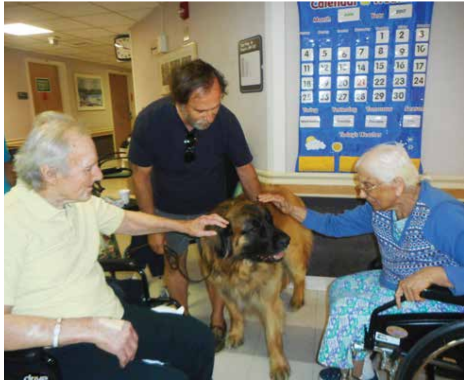
Inova Loudon Nursing and Rehabilitation Center, Leesburg, Va.